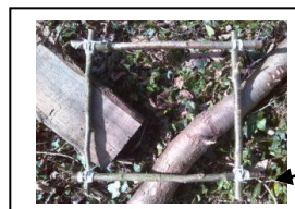
Wild weaving loom